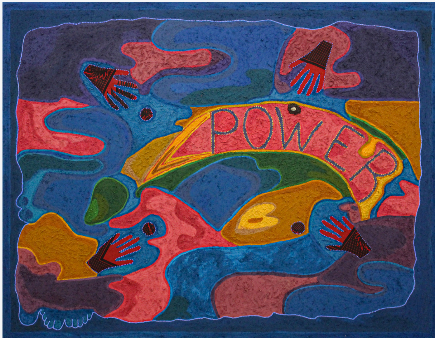
Tayari (Willing) Pigmented Elephant dung with acrylics on canvas, Textile (Kanga) and cowrie shell-2023 195x155cm