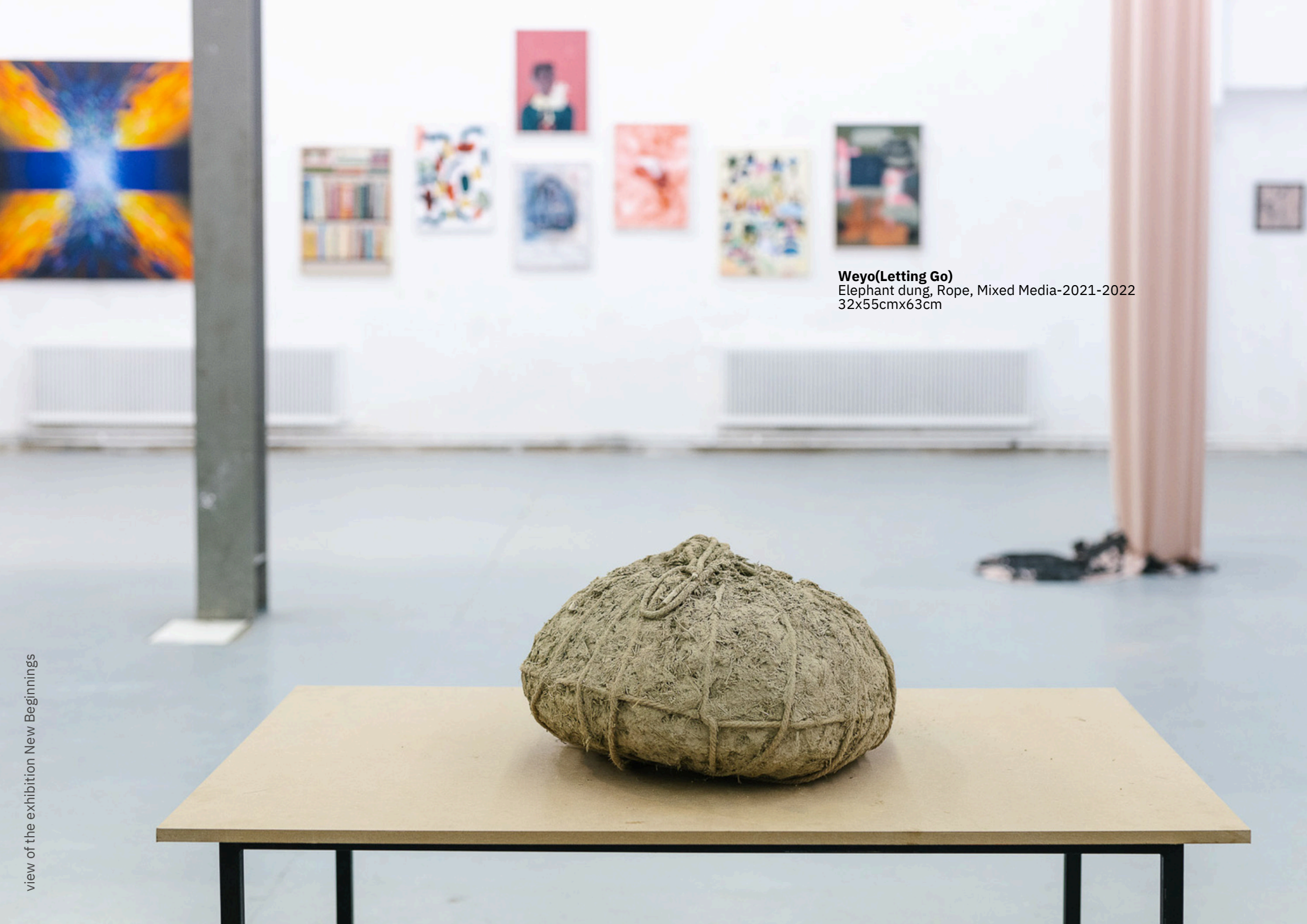
Weyo(Letting Go) Elephant dung, Rope, Mixed Media-2021-2022 32x55cmx63cm