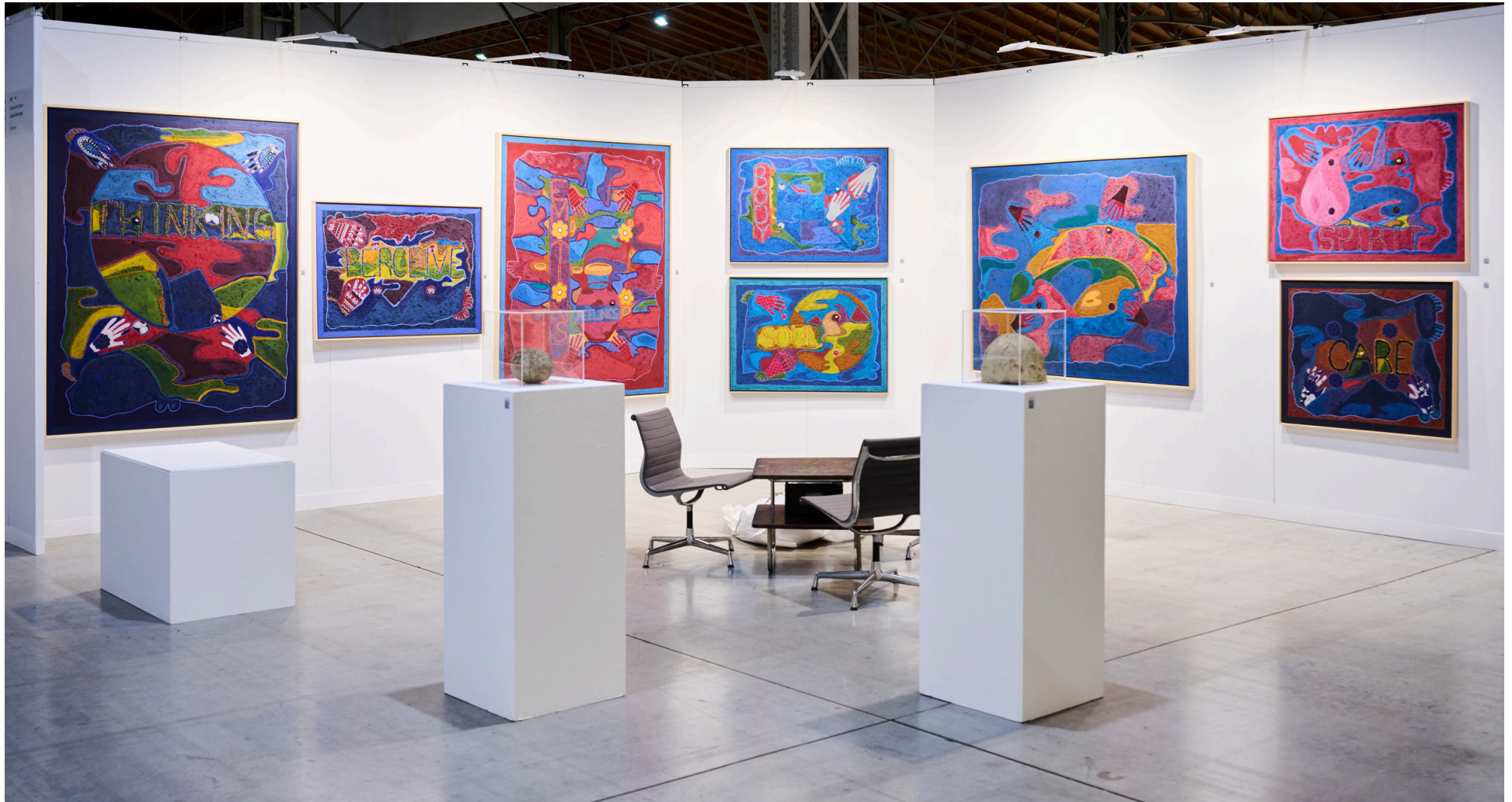
Loud Whispers from the ancestors SPARK FAIR VIENNA Solo booth. Vienna, Austria