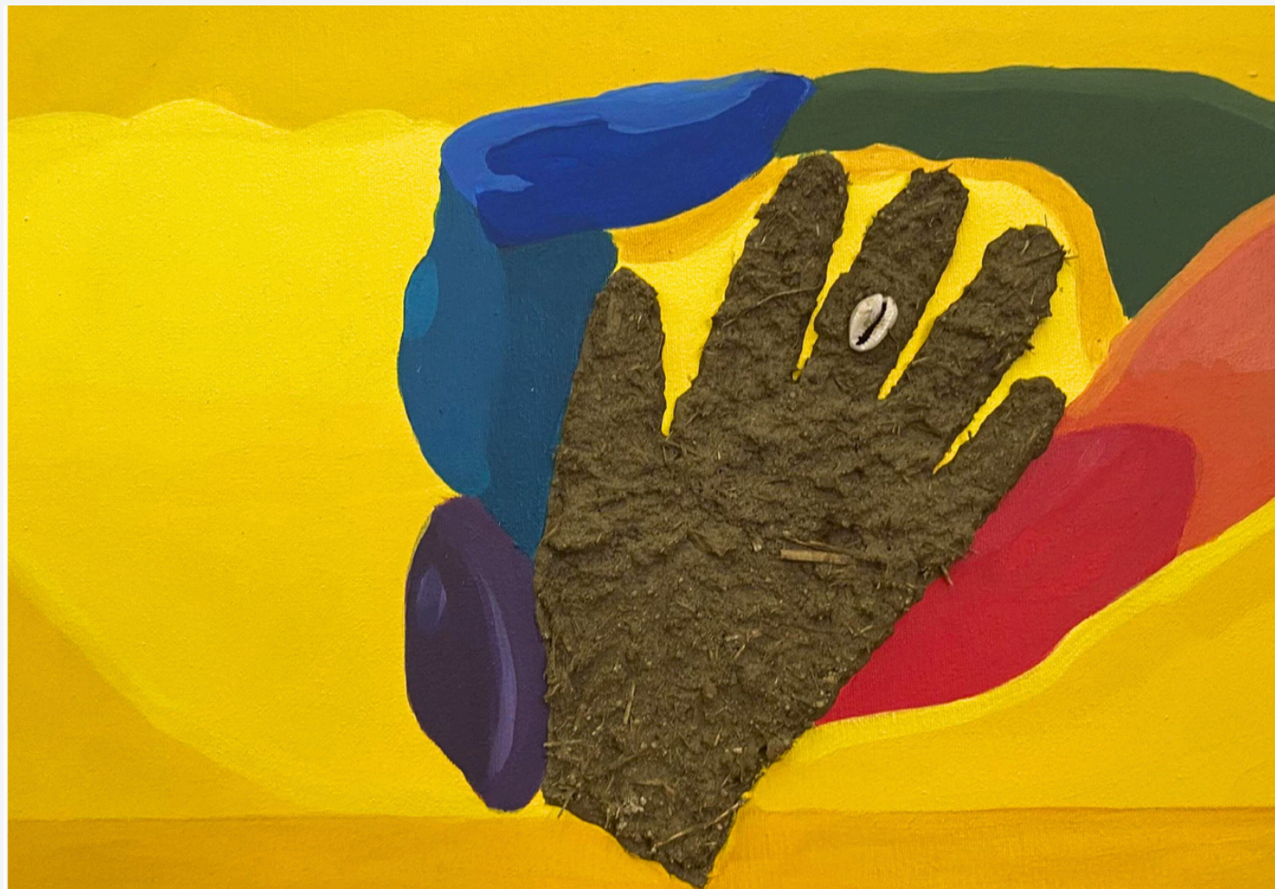
Tong gweno (Yellow) Acrylic on canvas, Elephant dung and Cowrie shell-2022 30x40cm