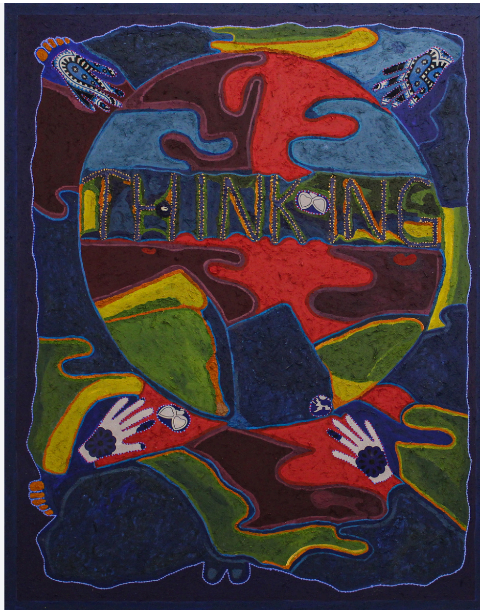
Fikiria(Thinking) Pigmented Elephant dung with acrylics on canvas, Textile (Kanga) and cowrie shell-2023 195x155cm