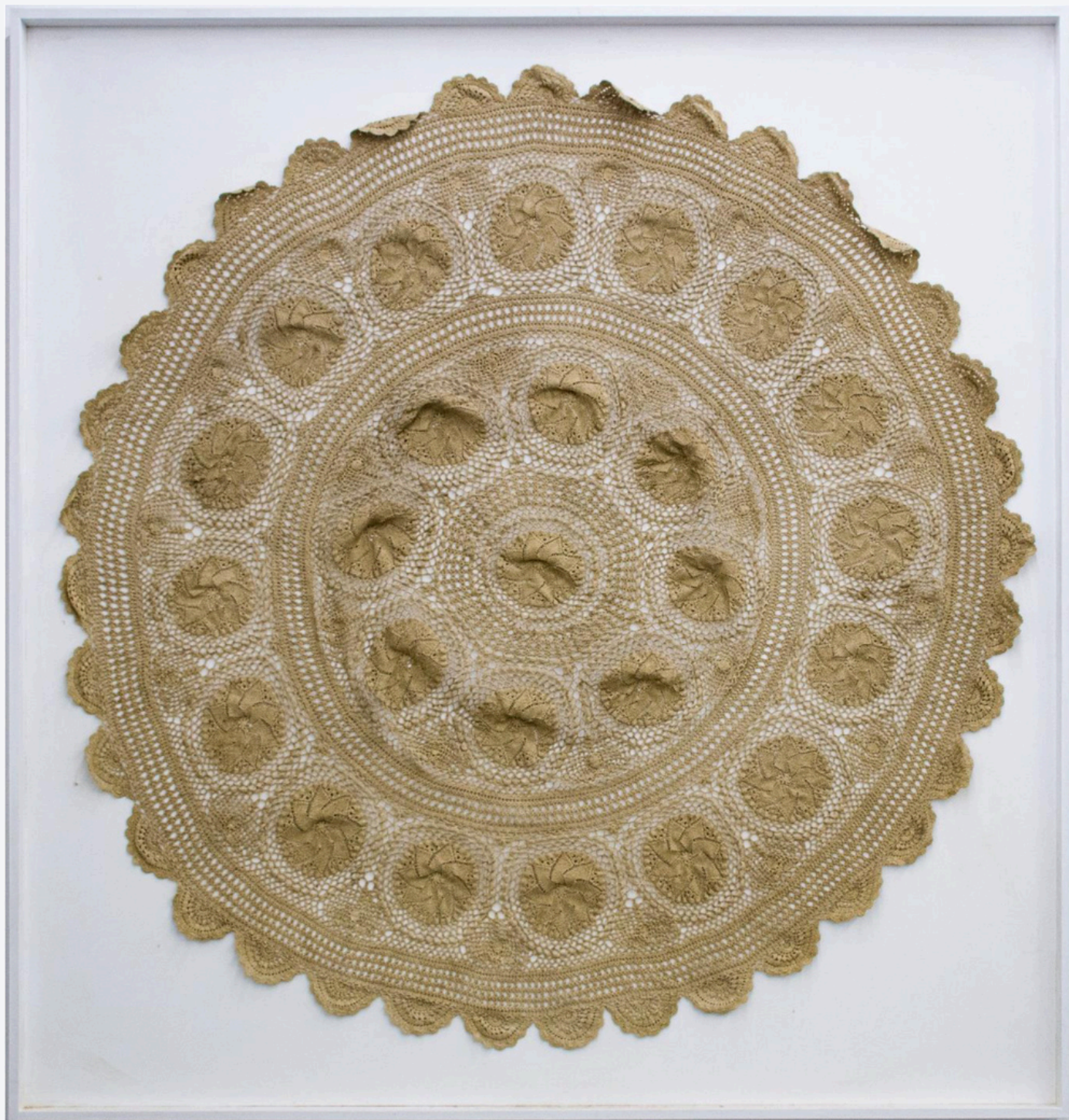
Erokamano Dani (Thank you Granma) Crotchet, Elephant dung on wooden frame-2022 170x160cm