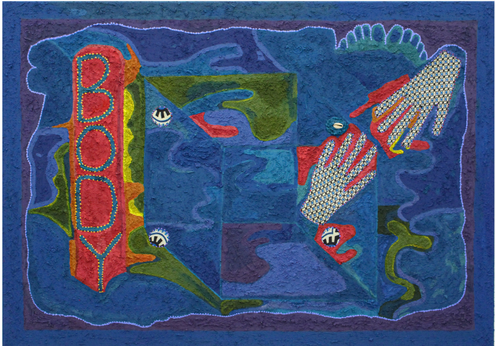
Mwili (Body) Pigmented Elephant dung with acrylics on canvas, Textile (Kanga) and cowrie shell-2023 90x125cm