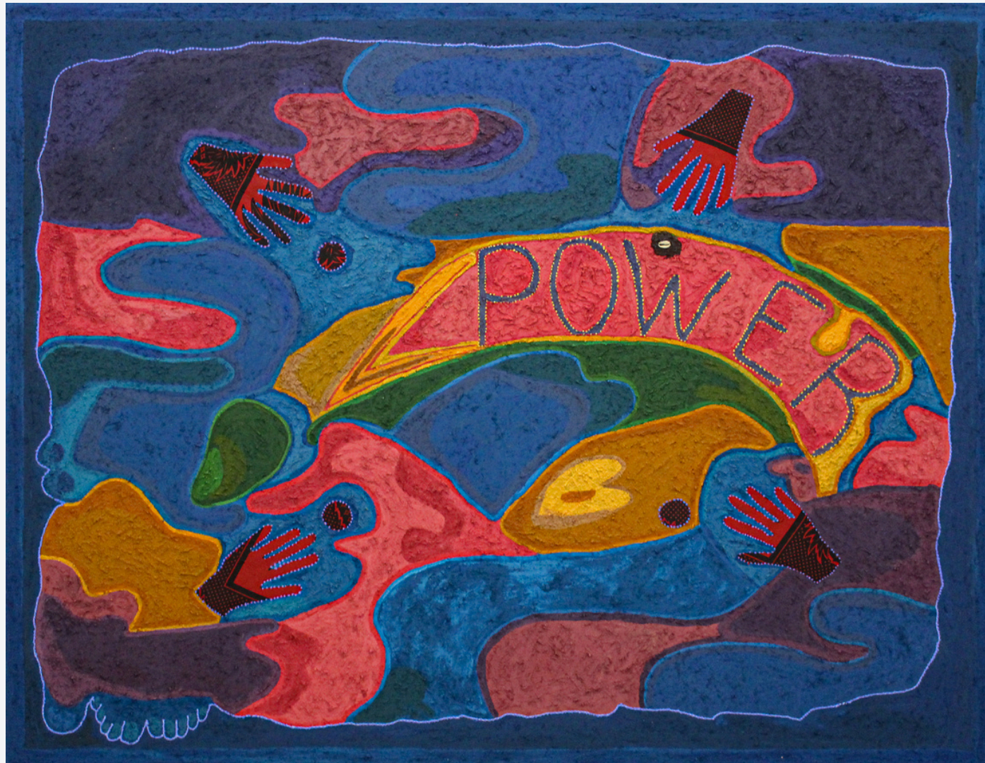
Tayari (Willing) Pigmented Elephant dung with acrylics on canvas, Textile (Kanga) and cowrie shell-2023 195x155cm