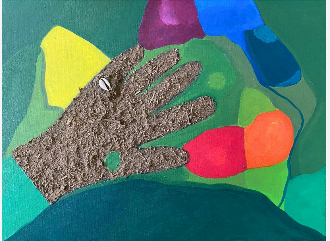
Ralum (Green) Acrylic on canvas, Elephant dung, Cowrie Shell-2022 30x40cm