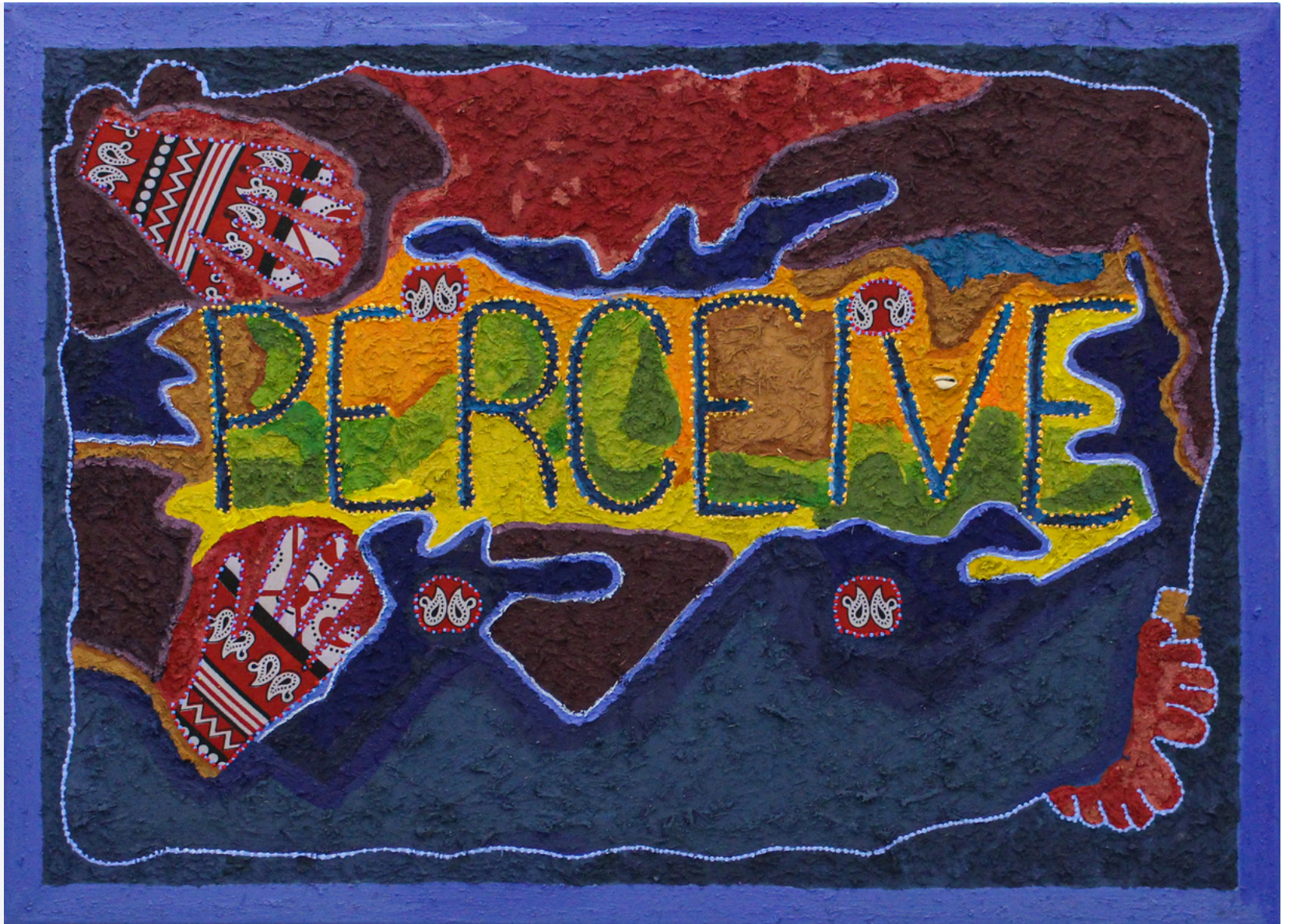
Kuhisi(Sensing) Pigmented Elephant dung with acrylics on canvas, Textile (Kanga) and cowrie shell-2023 90x125cm