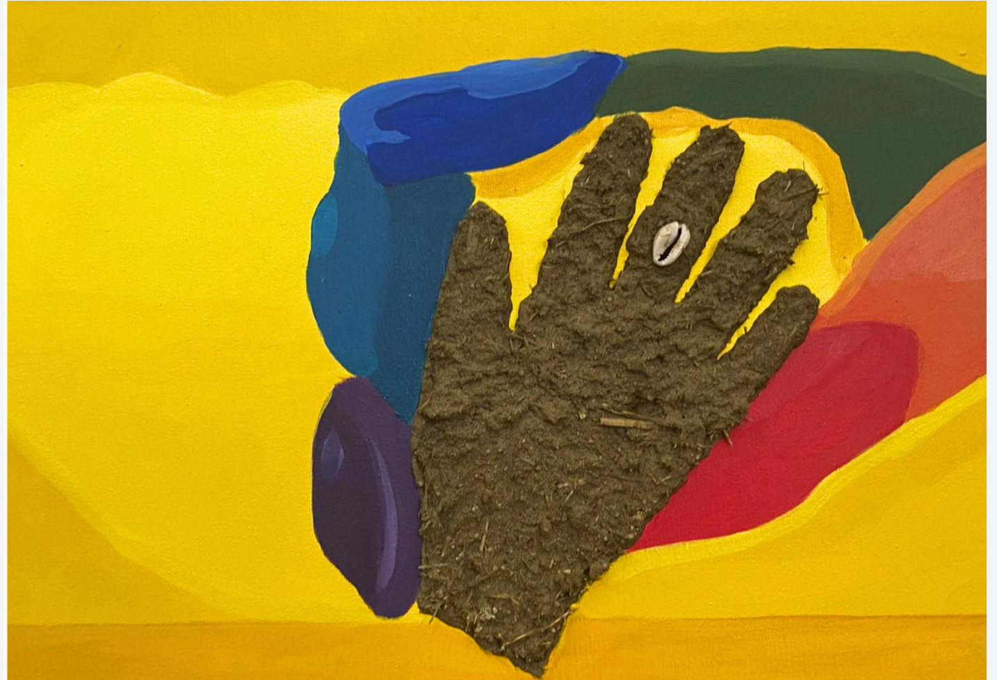
Tong gweno (Yellow) Acrylic on canvas, Elephant dung and Cowrie shell-2022 30x40cm