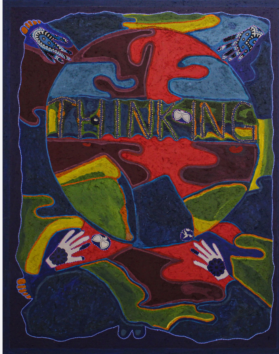
Fikiria(Thinking) Pigmented Elephant dung with acrylics on canvas, Textile (Kanga) and cowrie shell-2023 195x155cm