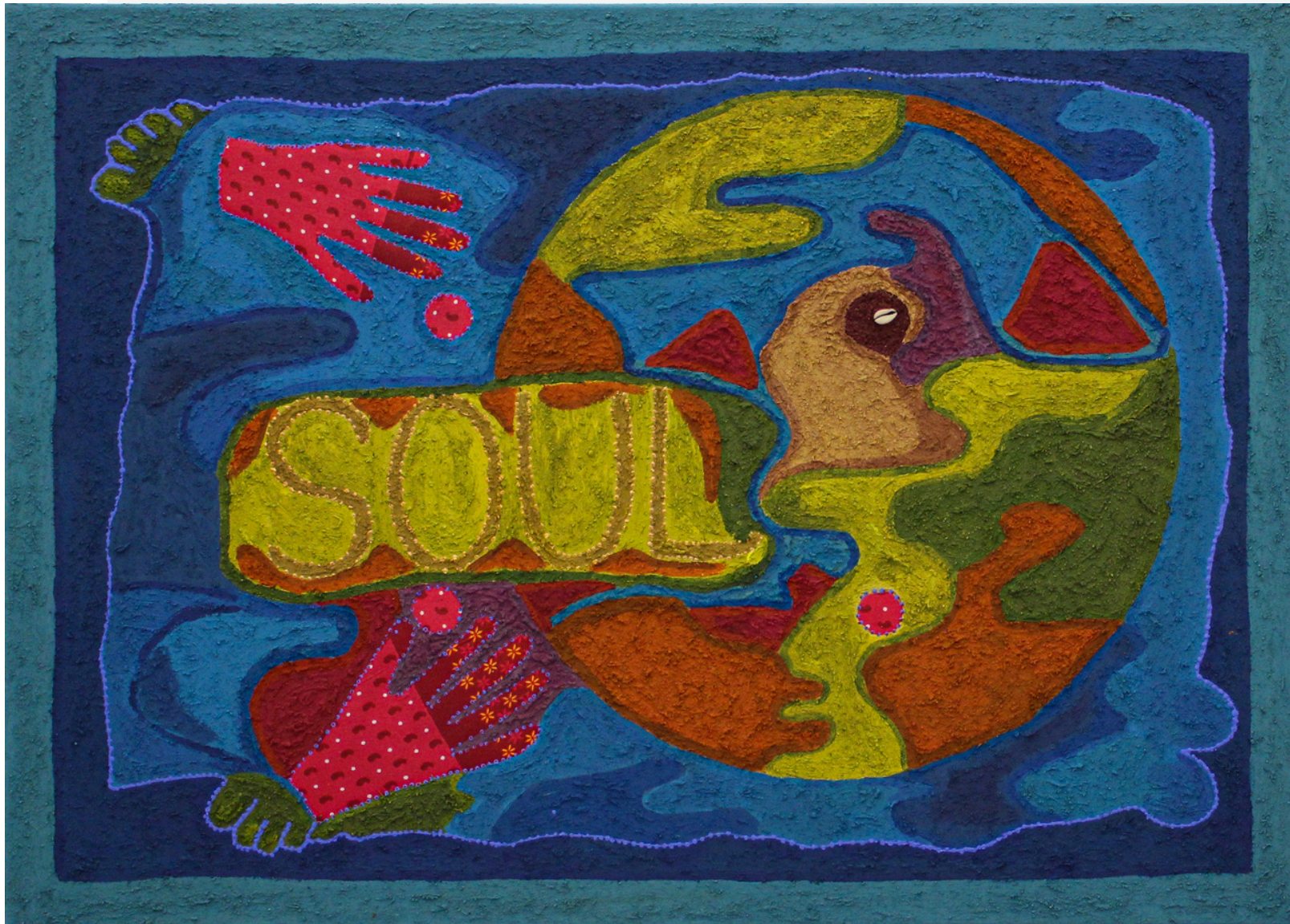
Nafsi(Soul) Pigmented Elephant dung with acrylics on canvas, Textile (Kanga) and cowrie shell-2023 90x125cm