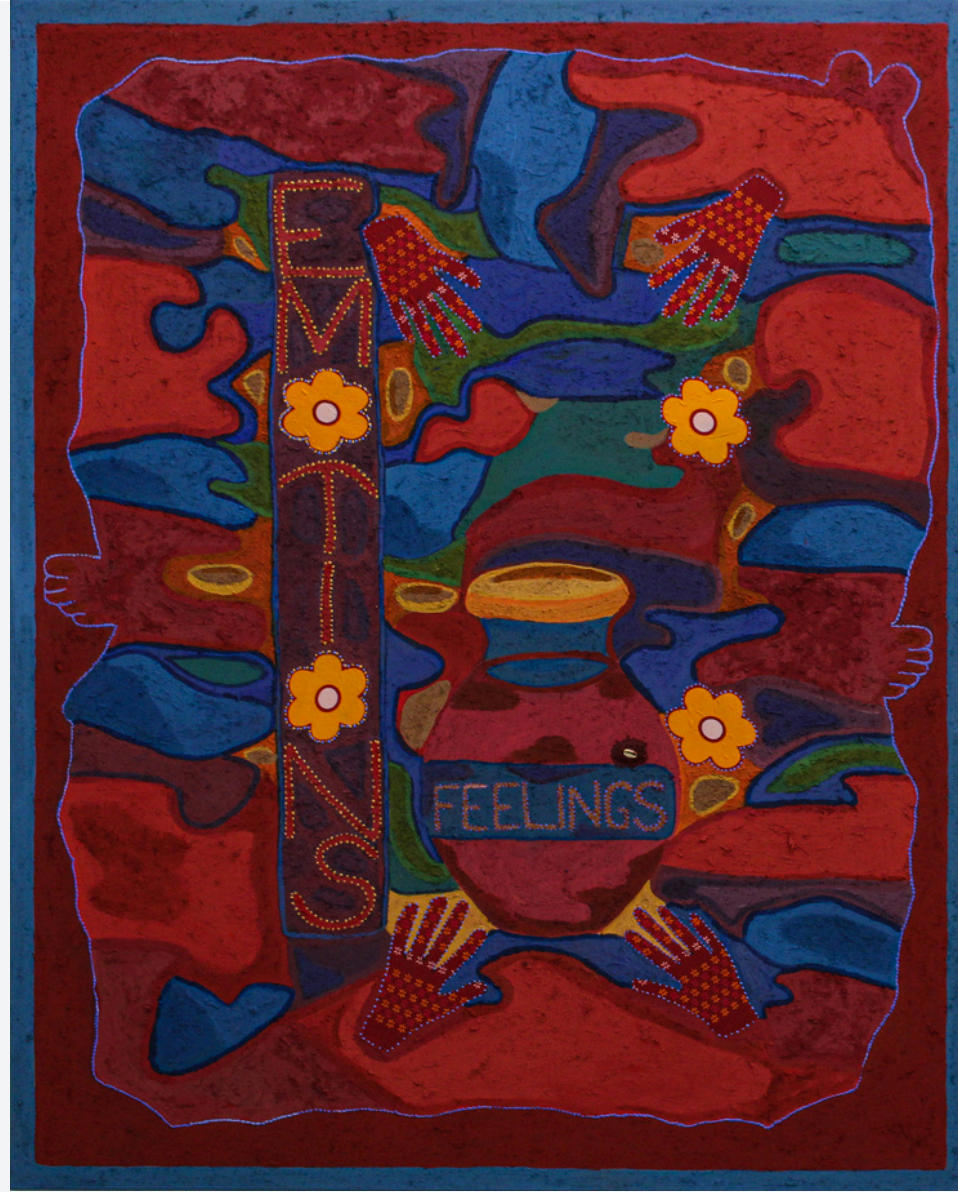
Hisia(Feeling) Pigmented Elephant dung with acrylics on canvas, Textile (Kanga) and cowrie shell-2023