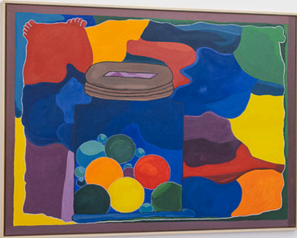
painting right: Erokamano (Appreciation) Acrylic on canvas-2022 195x155cm

view of the exhibition with the same name. FLOMYCA, Vienna, Austria