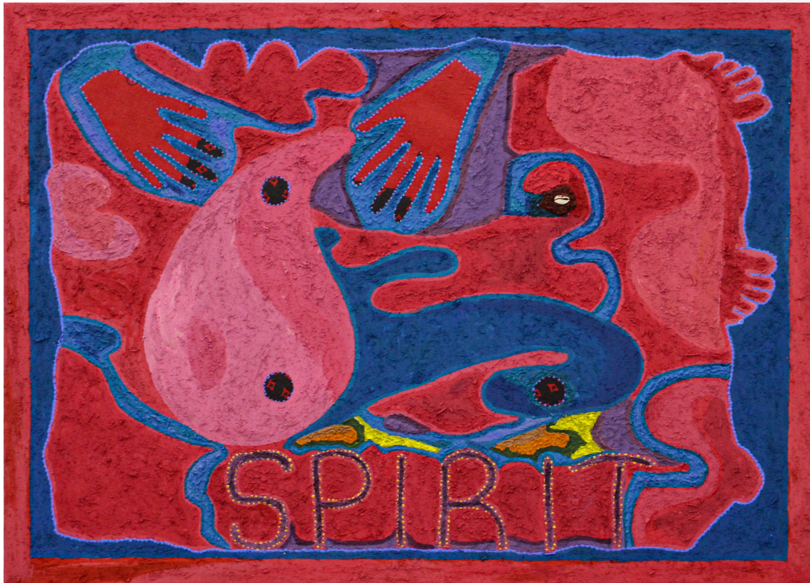
Roho (Spirit) Pigmented Elephant dung with acrylics on canvas, Textile (Kanga) and cowrie shell-2023 90x125cm