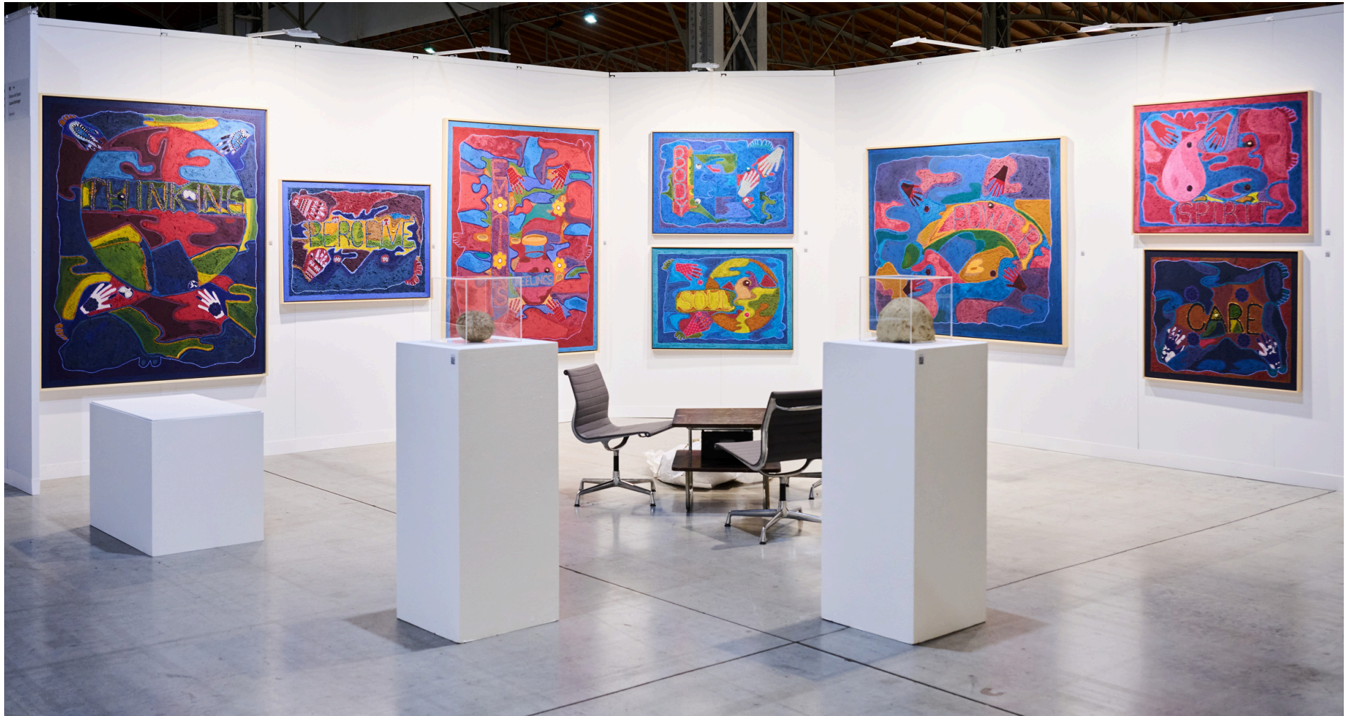
Loud Whispers from the ancestors SPARK FAIR VIENNA Solo booth. Vienna, Austria