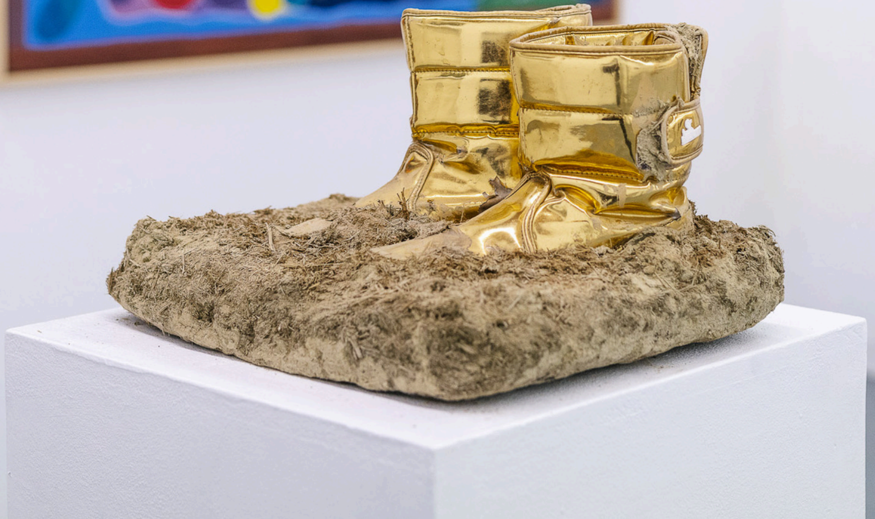
Woche (Shoes) Elephant dung, Golden Boots, Mixed Media 2021-2022 46x35x25cm